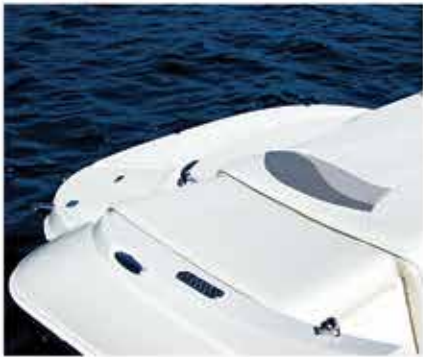
❖ optional filler cushion