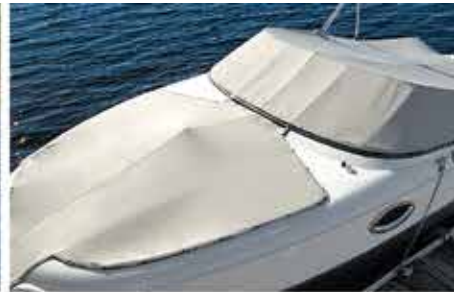
Cockpit Cover - Option #13, Bow Cover - Option #18