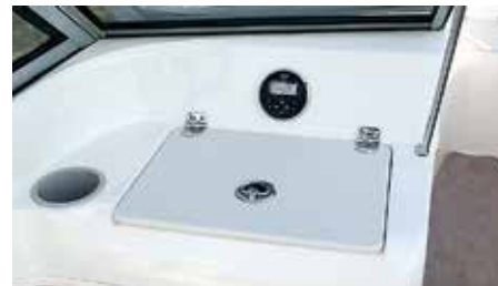
Passenger Side Glovebox / Stereo (varies by model) (180LS/LX, 195LS/LX, 204LR, 208LR, 225LR, 225SX)