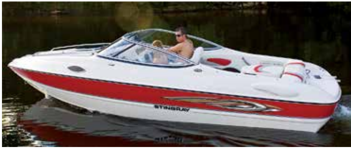
Two-Tone Hull Color Stripe (Option #51) (shown with optional hull graphic)