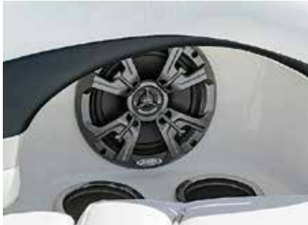
Recessed Speakers and Convenient Drink Holders