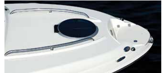
Bow Anchor Storage, Translucent Aluminum Deck Hatch, Stainless Steel Cleats, Navigation Lights, Stainless Steel Contoured Bow Rails, Bow Ladder