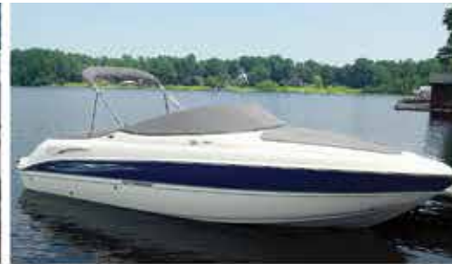
Cockpit Cover - Option #13, Bow Cover - Option #18