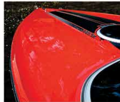
❖ optional solid deck and hull color