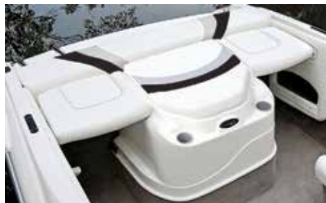
High Low Jump Seats Insulated Fiberglass Motor Box with Upholstered Pad (195LS, 195CS)