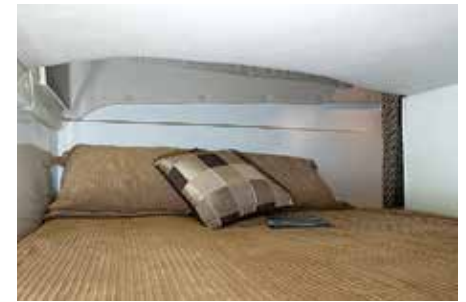
Aft Cabin with Full Size Bed (bedding and pillows not included) and Opening Vent Window (250CS)