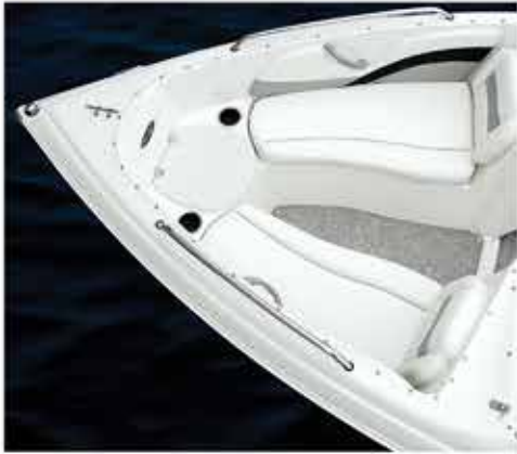
❖ optional snap-in carpet