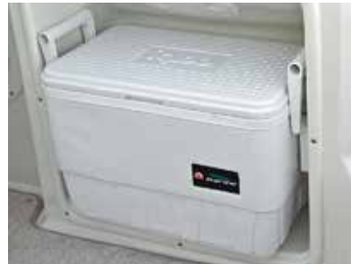
25-quart Removable Cooler (214LR, 215CR, 215LR, 225LR, 225CR, 235LR, 235CR, 250CS)