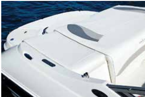
Walk-Thru Removable Filler Cushion (Option #47 or 77) (204LR, 208CR, 208LR, 214LR, 215CR, 215LR, 235CR, 235LR)