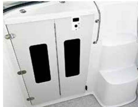
Integrated Bow Steps & Lockable Cabin Doors (208CR, 215CR, 225CR, 225SX, 235CR shown)