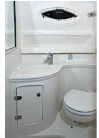
Full Function Head with Sink, Shower, Storage, and Opening Vent Window (250CS)

For the current and complete list of items, visit stingrayboats.com/options .