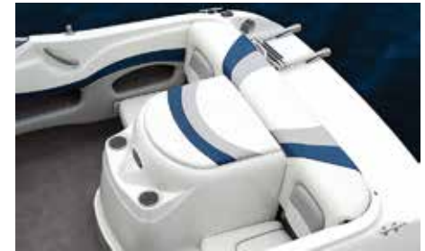
LS Interior - Bucket Seat, Lounge Seat, Motor Box and Jump Seats