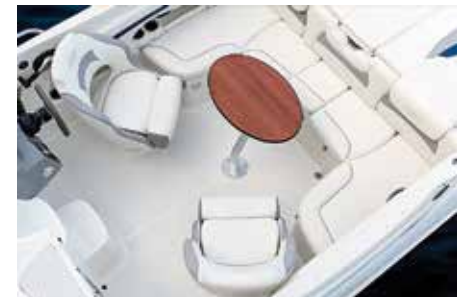
Cockpit Table with Floor Mount (225CR shown)