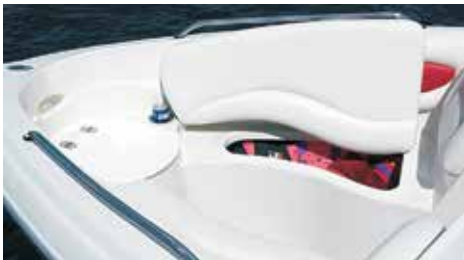
Bow Storage Areas