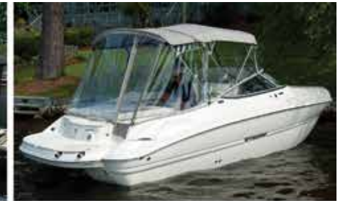
Camper Canvas (215 shown) - Option #15