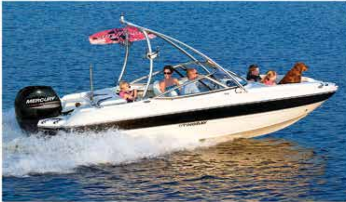
❖ optional wakeboard tower (board racks and accessories not included)