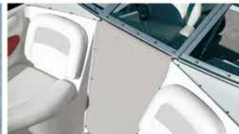
Walk-Thru Flap - Option #14

Standard canvas color is titanium. Colored canvas is an optional item (see chart above). The exceptions are the 195RX and 191RX models, which are available with blue canvas only.