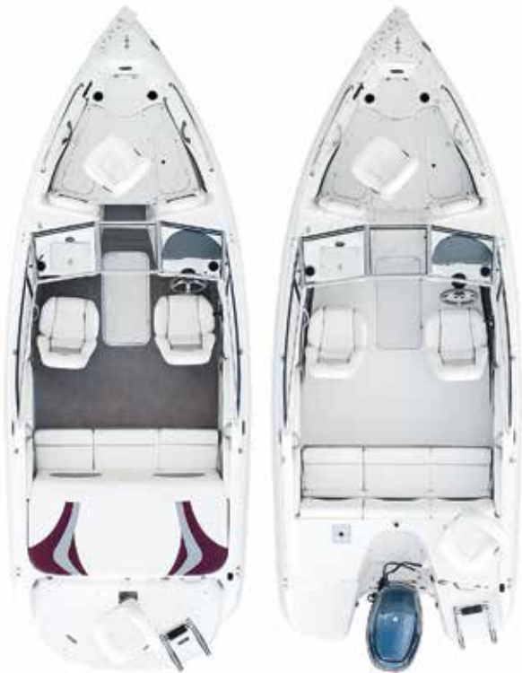
195LX and 191LX with Fish & Ski Package