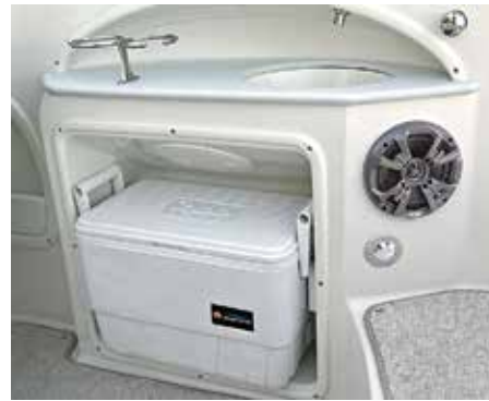
Freshwater Sink, Counter Top Area, and 25-quart Removable Cooler (235LR shown)