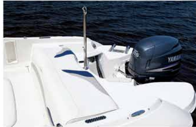
❖ optional stainless steel ski tow