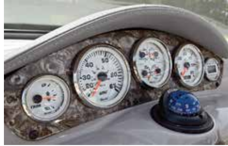
Custom Dash with Backlit Instruments and Stainless Steel Bezels