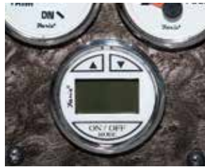
Digital Depth Finder w/ Alarm (Option #48)