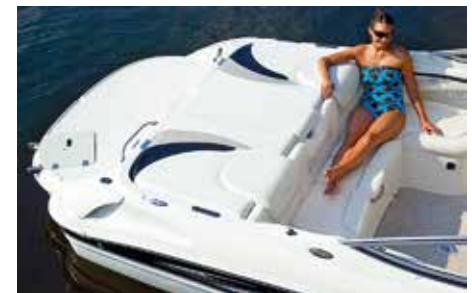
LR Bowrider Interior - Bucket Seats, Wrap-around Bench Seating, & Sport Style Sundeck