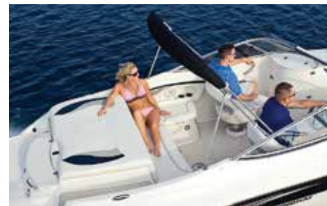
LR Sport Deck Interior - Bucket Seats, Wrap-around Bench Seating, & Sport Style Sundeck