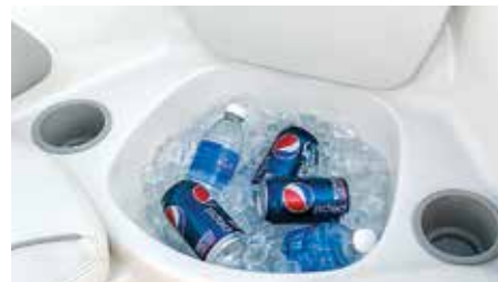
14-quart Ice Chest (195LX shown)