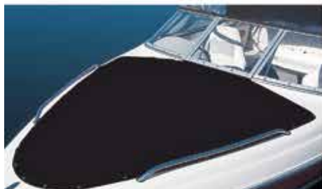
Bow Cover - Option #18, shown in optional black color