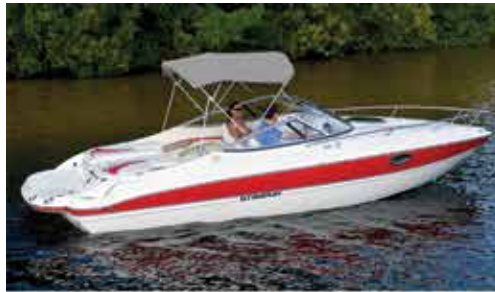
Stand-up Bimini Top with Windshield Connector (not shown) - Option #65

NOTE: Options 4 and 15 include a bow cover.