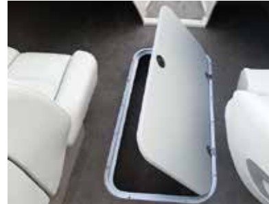
Floor Storage w/ Non-Skid Lid & SS Assist (195L, 204LR, 208LR, 214LR, 215LR, 225LR, 235LR)