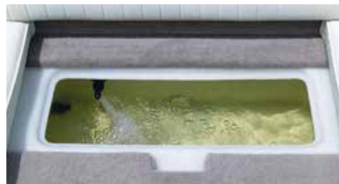
17-Gallon Aerated Livewell (195LX, 191LX Fish & Ski Pkg)