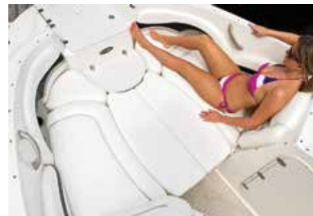
Bow Filler Cushions (Option #84)