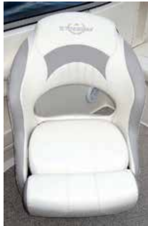
Sport Bucket with Flip-Up Bolster (225LR shown)