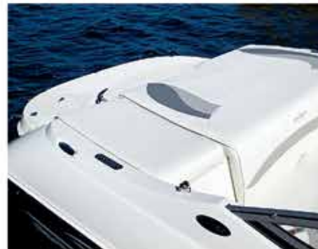
❖ optional filler cushion