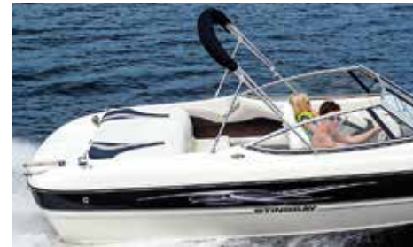
LX Interior - Twin Bucket Seats, Full-Width, Bench Seat, and Sport Style Sundeck