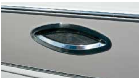
Stainless Steel Port Windows