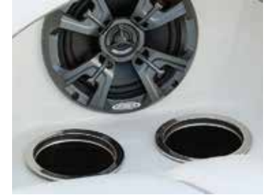
Stainless Steel Hardware Package (Option #55) Items vary by model. Refer to the footnote on page 44 for complete package details.