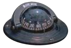
Ritchie Compass (Option #49)