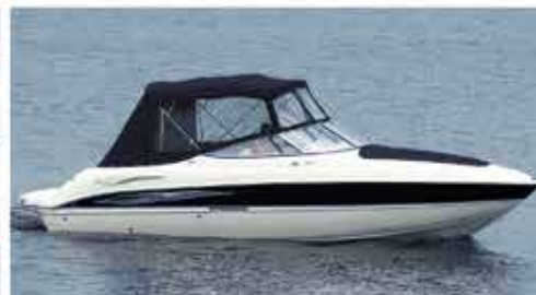
Full Canvas - Option #4, shown in optional black color