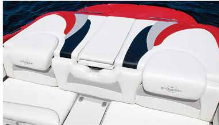
❖ optional solid deck and hull color