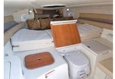
Molded Fiberglass Cabin Liner with Storage, Butane Stove, and Porta Potti